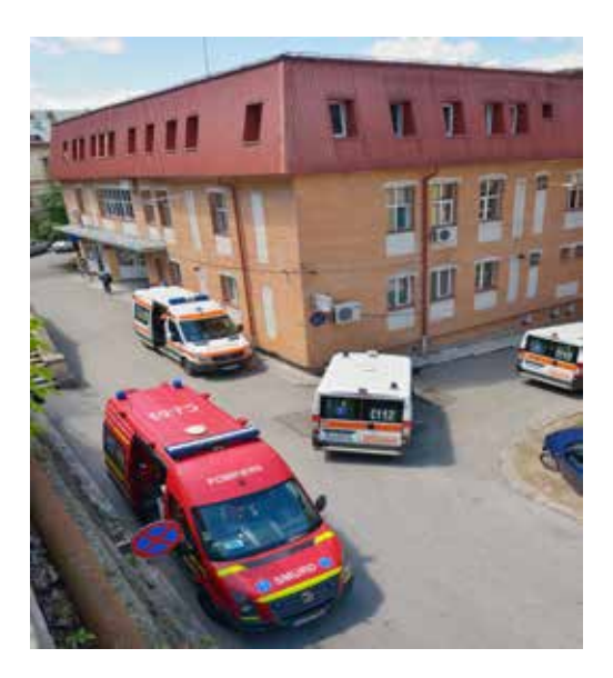
Emergency services – UPU (Unitatea de Primire Urgențe)

In the case of a medical emergency you can also go directly to the medical services situated on 3-5 Clinicilor Street, phone number 0264-431-876. In order to benefit from the medical services, you must have your ID and medical insurance card with you.